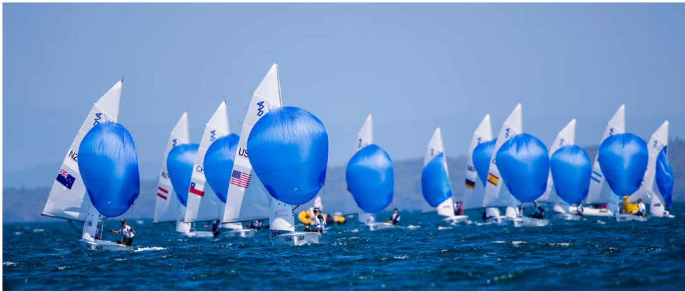
THE YOUTH SAILING WORLD CHAMPIONSHIPS IS THE PINNACLE EVENT FOR YOUTH SAILORS.

This event is run by World Sailing as a mirror of the Olympics. It's open to sailors who are under 19 on December 31 in the year of the event and Yachting New Zealand are invited by World Sailing to select and send a team each year to represent New Zealand, known as the NZL Sailing Foundation Youth Team.