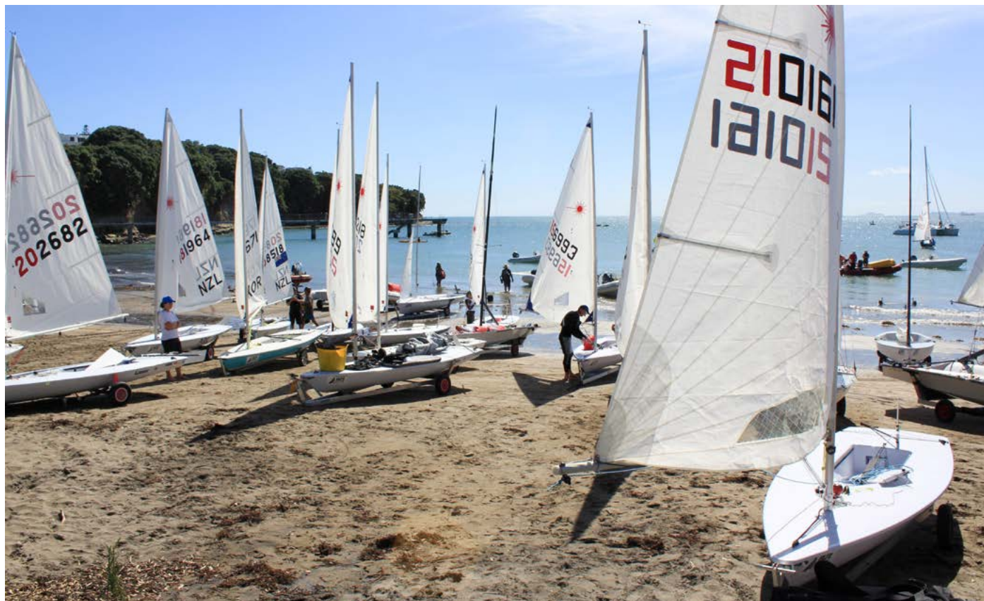
MANY NATIONAL EVENTS PROVIDE GOOD COMPETITION AT A FRACTION OF THE COST OF INTERNATIONAL REGATTAS

These events are the foundation that allows a young sailor to build and test their skill, see where they sit compared to their peers and open their eyes to the areas they need to work on without having to travel internationally.